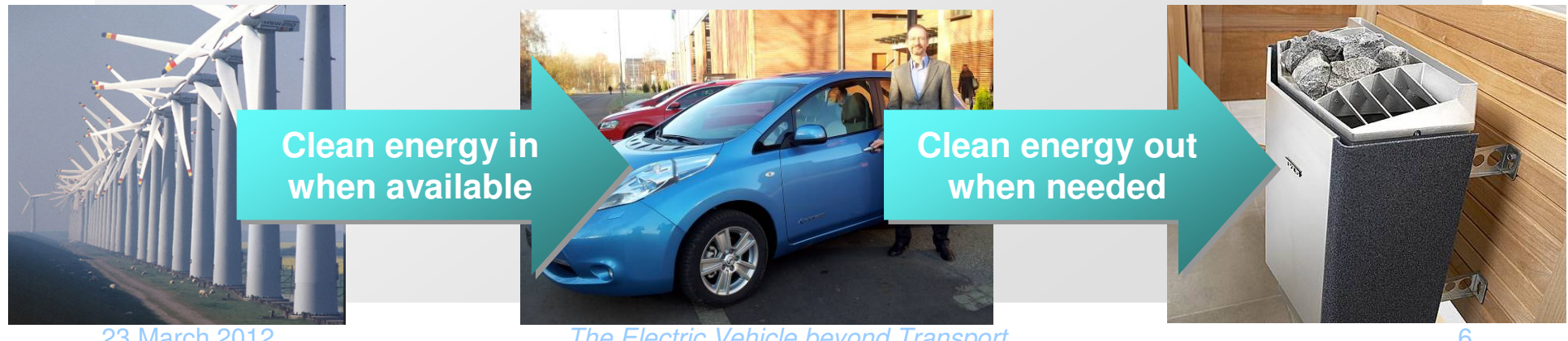
The Electric Vehicle beyond Transport